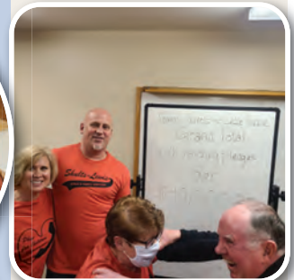
"Team Perrett vs. Team Little Pebble"